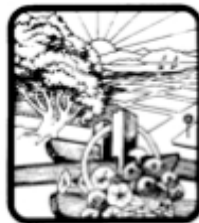
Santa Clara Organization of Planning and the Environment (SCOPE)